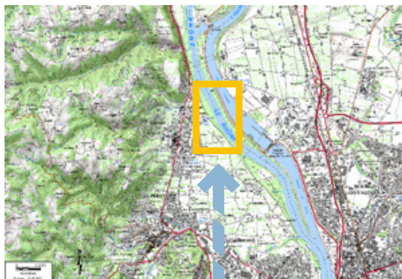
IGN - Scan25®