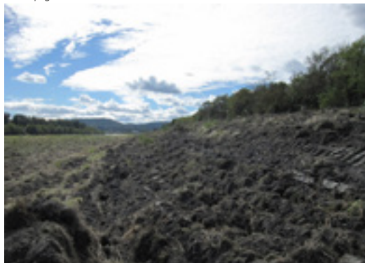
The fallow Petite Île site prior to the work. October 2011.