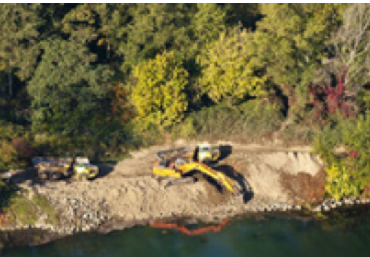
Opening of the Girardon dike at Cornas. October 2011.