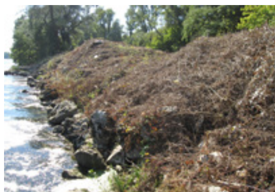
Old Girardon dike along the Rhône where flood debris accumulated, before the dike was opened. September 2011.