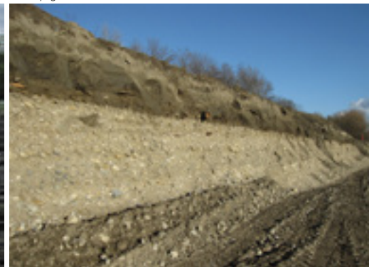
Vertical earthwork on the Petite Île site. The stratification (gravel layers) is clearly visible.

• did not appear to have any major vulnerabilities concerning their ecological value or any heritage issues. The mobilisation of sediment (self-dredging) by the current appeared to be sufficient. Consequently, three sites (Cornas, Roubion and Petite Île) were selected for removal of the lateral dikes.